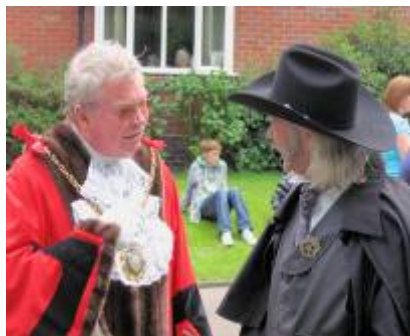
The Mayor and "Sheriff" at Lichfield Bower

The traditional civic events of the year were well supported, including the Shrovetide 'Old Fair', St George's Court, the Bower, the Court of Arroye, and the Sheriff's Ride.