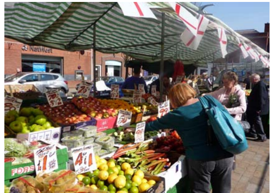
Lichfield St George's Day Market

The Lichfield Markets have maintained their viability despite the economic recession and the very harsh winter weather. Gross income from stall rental 2009/10 was £138,800 which was the same as for the previous. However, the costs of running the markets increased, and so the net income from the Markets was £38,500 - a 10% fall on the previous year.