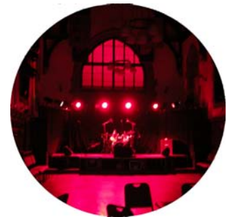
Halloween at Guildhall

Plans for the coming year include a pedal powered "smoothie-maker" machine for the Fuse festival.