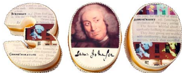
Three birthday cakes!

The City Council is the sole trustee of the Johnson Birthplace Trust which is a registered charity.