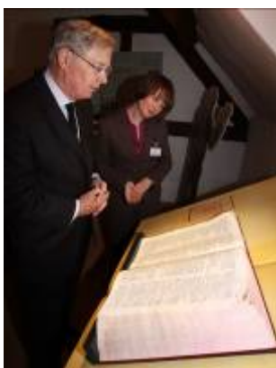
Visit of HRH Duke of Gloucester

2009 was a hectic year for the Museum as it marked the tercentenary of Samuel Johnson's