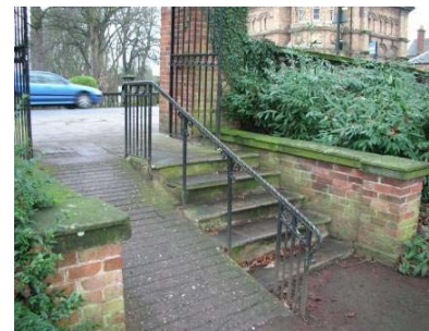
Existing access to Remembrance Gardens

The Council, in partnership with the District Council, has been awarded £3.9 million from the Heritage Lottery Fund for restoration of the City centre parks. Works have now commenced and are due to be completed by May 2011. The City Council elements within the scheme relate to Pool Walk and the Remembrance Gardens and comprise about 20% of the total works. The total cost of works to these areas will be £1.1 million, of which the HLF grant provides 75% of the funding. The works will help not only to restore the parks to their former glory, but will also include various improvement works, such as a new DDA compliant ramped access to the Remembrance Gardens.