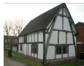
Cruck House, Stowe Street

The committees manage the buildings, paying the running costs and receiving income from lettings, but with the Council responsible for maintaining the external fabric of the buildings. As part of this maintenance the Council undertook major repair works to Cruck House in spring 2009.