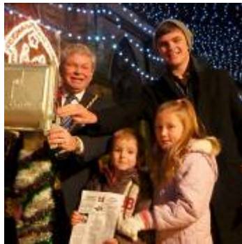
Lights Switch On