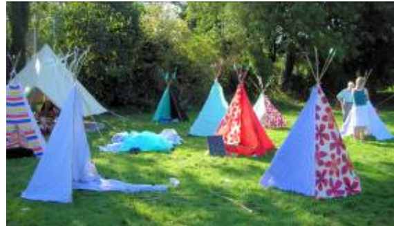
Tepee making at the Environment Day

The Open Spaces Officer was also involved in running several community-based workshop projects during the year including willow sculptures, artwork to liven up bus shelters, and a children's tepee making workshop at the Environment Day on Stowe Fields.