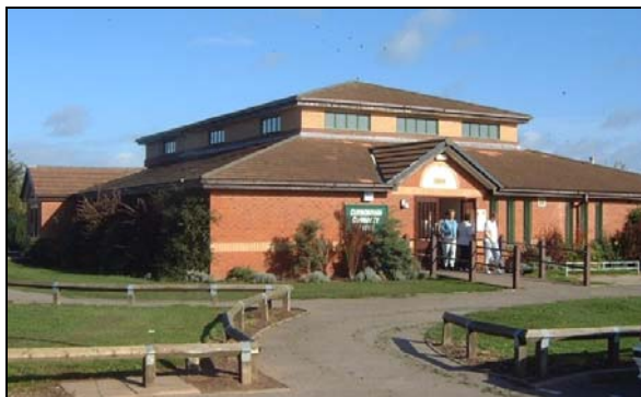
Curborough Community Centre

Curborough Community Centre was built by the Council in 1994, with a major extension built in 2001. It comprises a main hall, two smaller halls, a meeting room and office, together with kitchen/bar, and toilets. Both Cruck House and Curborough Community Centre are leased to the Curborough Community Association.