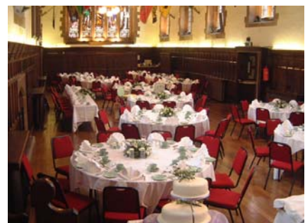
Wedding Reception in Guildhall

This lift installation is now nearing completion and will provide a larger DDA compliant lift, with the added advantage that the Ashmole Room will now be accessible by the lift.