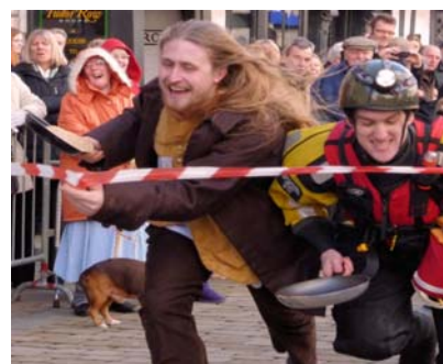
Shrovetide Pancake Races