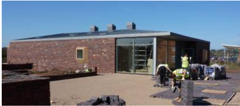
The new Darwin Park Community Hall nearing completion

The construction of the Darwin Hall will be completed on 21 May. It will be open for bookings from June 2010 and will provide a modern and well-equipped meeting place for the estate and city. The Hall has cost £780,000 most of which has been funded by S106 money provided by the estate developer. The Hall contains several “green features” to reduce its carbon footprint, including an under-floor heating system operated from a ground source heat pump. A new Darwin Hall Community Association has been created to run the Hall. This will be a charitable limited company, involving many local residents and hall users.