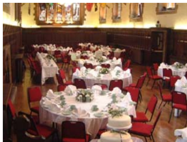
The Guildhall is available for public hire and is an ideal venue for meetings, concerts, and weddings

The Guildhall is an historic building (Grade II listed). Rooms are hired out to the public, to local organisations, and for commercial sales, etc. The Guildhall is also licensed for civil marriages. There are different rates of hire charge depending on the nature of the booking (charities and voluntary organisations pay the lowest rate). Commercial bookings account for about a third of the hours let, but two-thirds of the hire income. The Guildhall is also used for Council meetings.