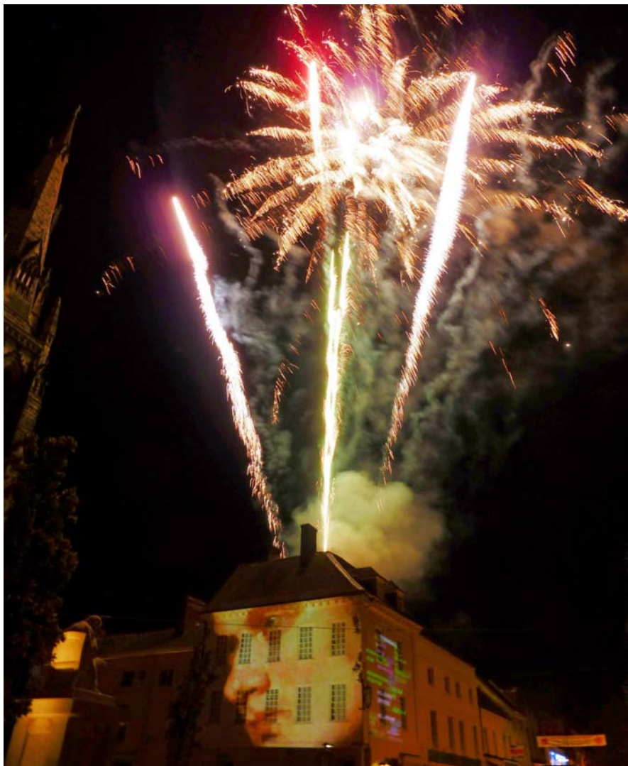
Firework finale to the Johnson tercentenary son et lumière