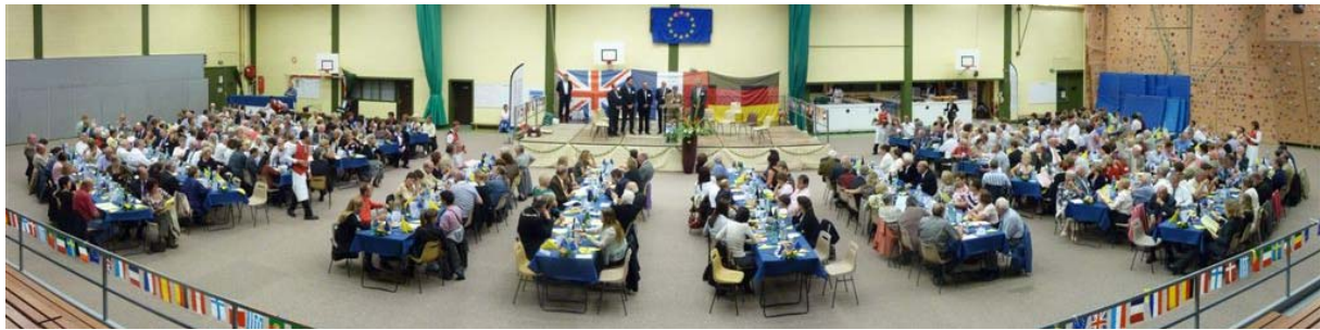
Twin town reception at Sainte Foy