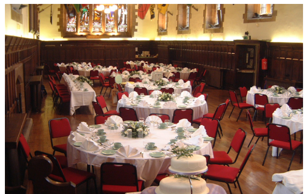
The Guildhall is available for public hire and is an ideal venue for meetings, concerts, and weddings