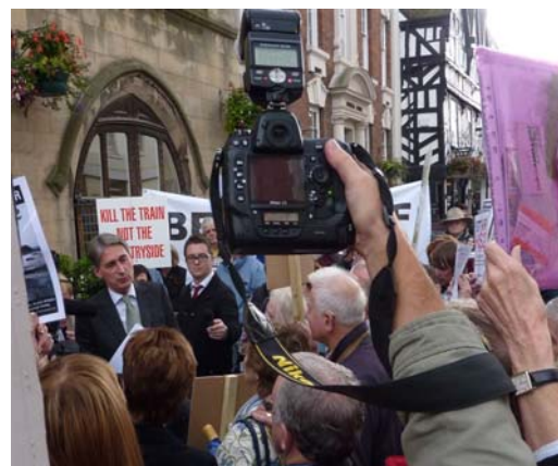
Transport Secretary Philip Hammond meets with HS2 protestors outside the Guildhall

The Council has also expressed concern about plans for the HS2 Rail link which will skirt the City boundary. Following a meeting at the Guildhall with the Secretary of State for Transport, Philip Hammond, a revised route has been proposed which is further from the City. An exhibition on HS2 was held at the Guildhall in June 2011 which Philip Hammond also attended.