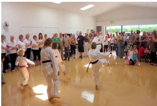
Darwin Hall Opening

Curborough Community Centre and Cruck House are leased to the Curborough Community Association, and the Boley Park Community Hall is leased to the Boley Park Community Hall Management Committee.