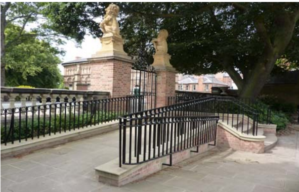
Remembrance Gardens entrance after HLF Scheme