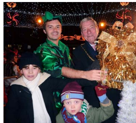
Christmas Lights Switch on

The Council is undertaking a rolling programme of changing to LED bulbs in order to reduce the energy costs and the 'carbon footprint' of the Christmas lights, and this resulted in significant savings in energy costs.