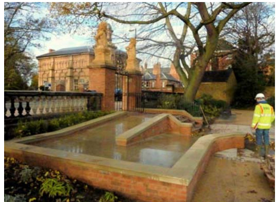
New entrance ramp at Remembrance Gardens under construction

The Council owns over 12 acres of allotments which are leased to the Lichfield Allotments Society. There has been a large upsurge in demand for allotments and the Council is looking to acquire additional allotment land at Christchurch. In the longer term the Council is seeking to have land allocated for allotments in the forthcoming Local Development Framework.