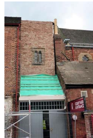
Guildhall Lift under construction

The new DDA compliant lift is proving a great improvement with the added advantage that the Ashmole Room is now accessible to wheelchair users.