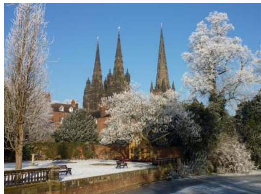
Winter scene at the Remembrance Gardens