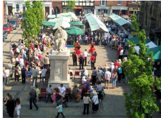
St George's Day Market

The popular St George's Day Market was repeated, and proved a great success. The monthly Farmers' Market also goes from strength to strength and in June 2011 celebrated its 10 th birthday.