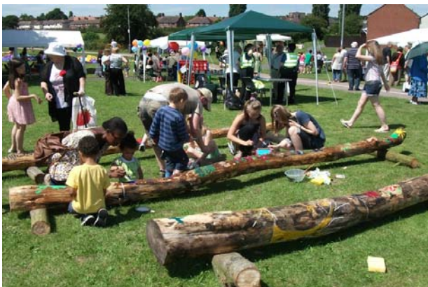
Stowe Croft Birthday Event

The Council represents the interests of the City and makes representations on matters such as the Local Development Framework and HS2. The Council provides secretarial and administrative support for the Lichfield City Forum.