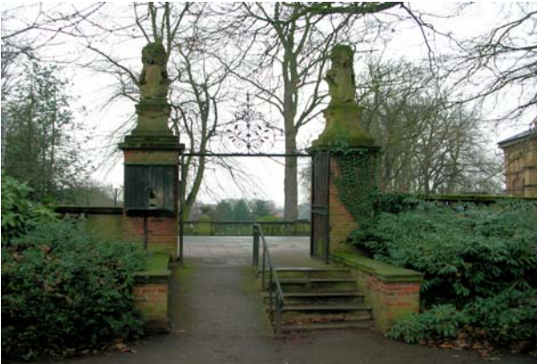
Remembrance Gardens entrance before HLF Scheme