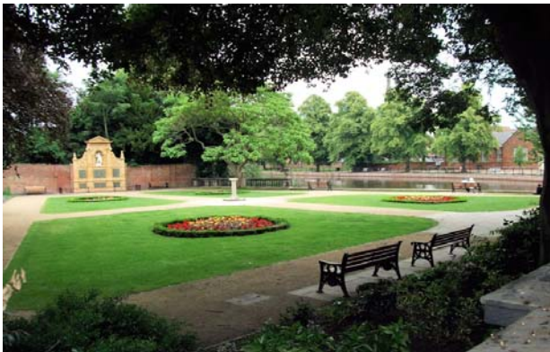
Restored Gardens of Remembrance

The Council owns and/or maintains some 31 Hectares (76 acres) of open space and churchyards on over 70 separate sites in the city. These include the Festival Gardens, Pool Walk, Remembrance Gardens, plantations off Eastern Avenue, parts of the churchyards at St Chads, Christ Church and St Michaels, and various smaller areas around the City.