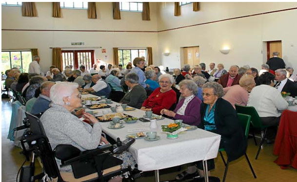
Mayor's Entertainment & Tea at Curborough Community Centre

Curborough Community Centre was built by the Council in 1994, with a major extension built in 2001. It comprises a main hall, two smaller halls, a meeting room and office, together with kitchen/bar, and toilets. Both Cruck House and Curborough Community Centre are leased to the Curborough Community Association.