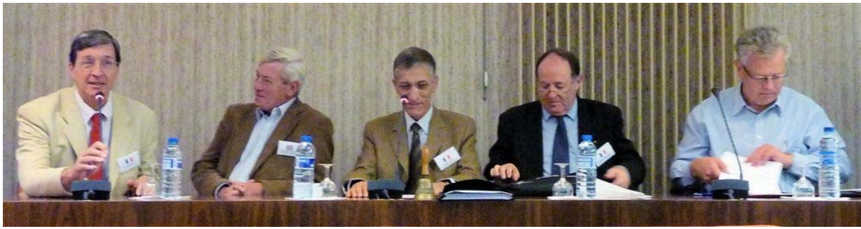
Twin town representatives meet in Sainte Foy