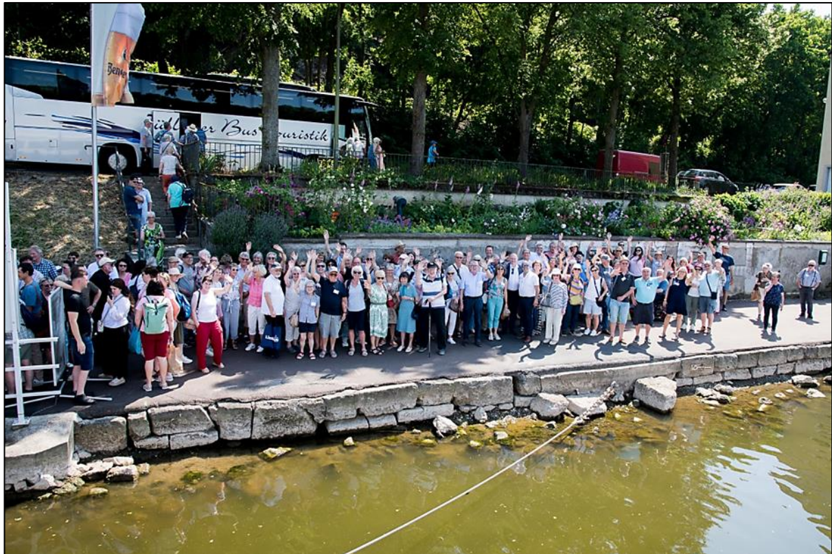
Guests returning from a river cruise along the Lahn river, welcomed by the Mayor of Limburg