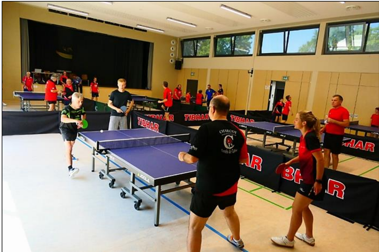
Table tennis tournament between Lichfield, Limburg and Ste. Foy