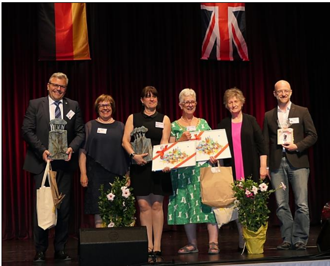
The 3 Mayors with the Limburg Twinning Association's executive team

A selection of further photographs follows.