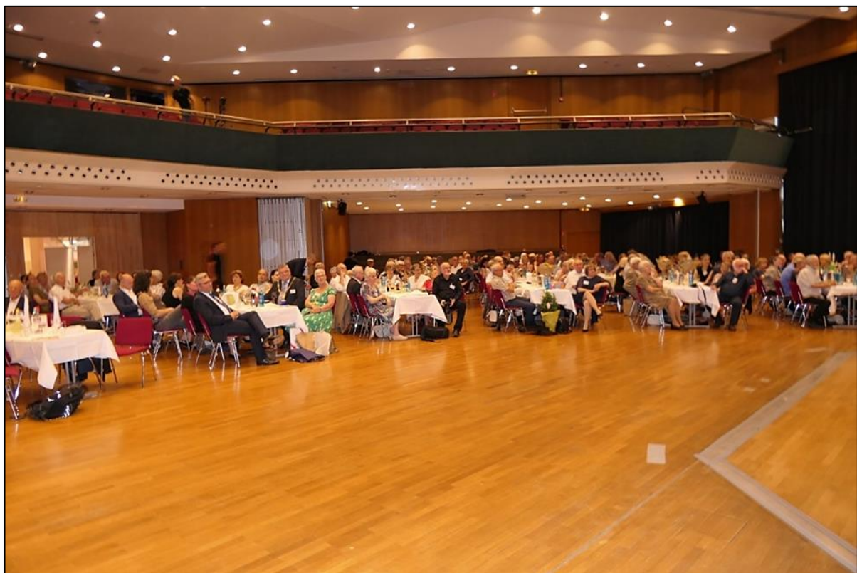
Celebration evening with entertainment in the Limburg City Hall with 400 guests