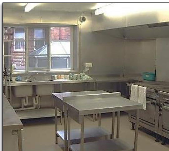
Guildhall kitchen before

The work was completed on time, on budget and to a very good standard by Box Construction Limited.