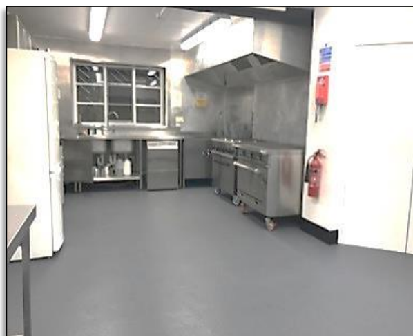
Guildhall kitchen after

While on site Box were also asked to carry out some minor repair work to the remaining Guildhall cell that is closed to the public. The loose door frame has been repaired and missing brick infills replaced, plus some repointing has been completed to the rear wall. Once cleared it is hoped that this final cell will be open to the public early in the 2018 season.