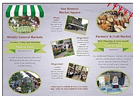
Leaflet Fully Opened