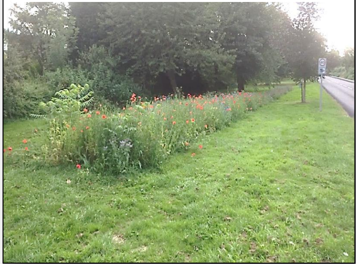
Meadow following the canal route alongside the A51 Tamworth Road. It is not quite the blue mix we had been promised!

The plans for the roundabout bedding have been supplied to Staffordshire County Council for a planting licence, once this has been achieved applications for planning permission for the boards and an advertising licence can be made.