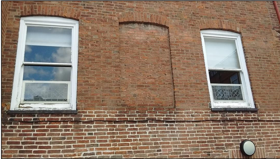
Moulton Room and Minstrels' Gallery Windows Prior to Repairs

Preparations continue for the Sheriff's Ride and Christmas Lights Switch On; the Deputy Town Clerk will shortly be attending the Safety Advisory Group meetings at the District Council for each of these events.