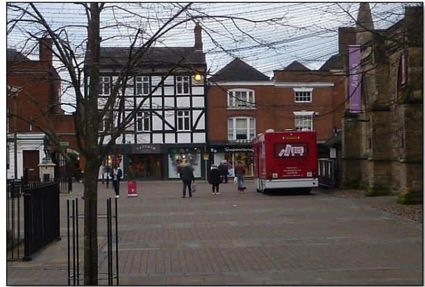
On 17 & 18 December The Red Book Bus hired the Market Square to sell children's books at a reduced cost. They hope to return in February.