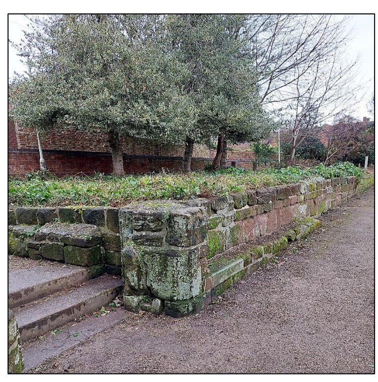
Footpath - Christchurch Lane to A51 Allotments (FP 16)